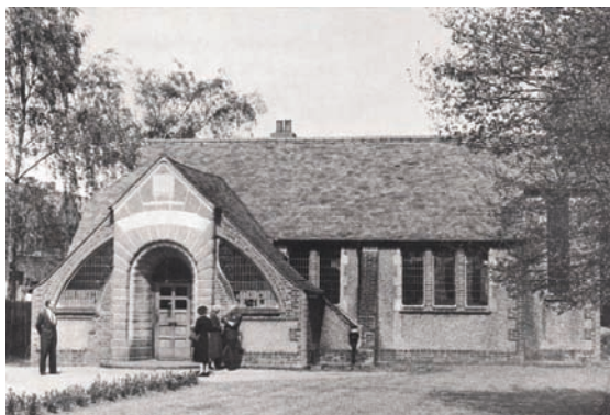
Claygate New Church (now demolished)