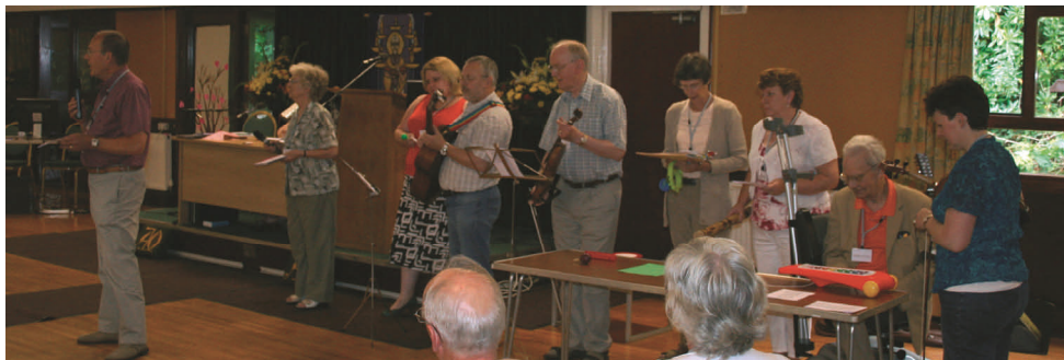
The Music Group