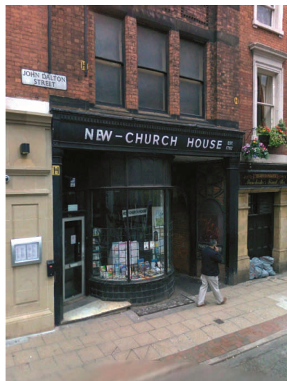
New Church House

These ideas are not necessarily mutually exclusive. Realistically, they are only likely to happen if people are enthused by them or find ways of expressing other